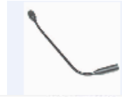
MC-808 Flexible Microphone

BND cables Connecting cables between FD-800S and FD-300A