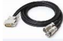
CU-50 Connecting Cable