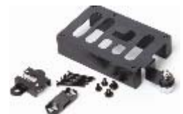
Sony Camera Attachment TA-300