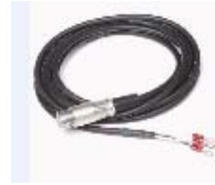
CU-50 Connecting Cable