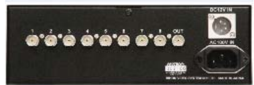
HS-850 Rear Panel